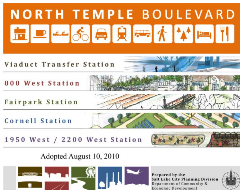
Figure 1: Cover of the North Temple Boulevard General Plan

Council District: District 2, Alejandro Puy